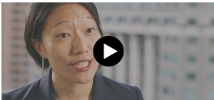
What Is Your Most Memorable Moment at Covington?